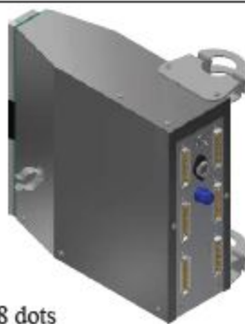
NZ head 48 dots