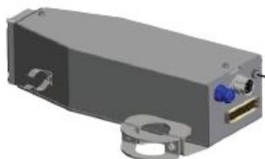
NZ head 7 dots

There are no limits regarding the environmental specifications of the working site. The limits can arise if you are using certain types of ink. Please read paragraph 1.3 of the Manual instruction for safety precautions.