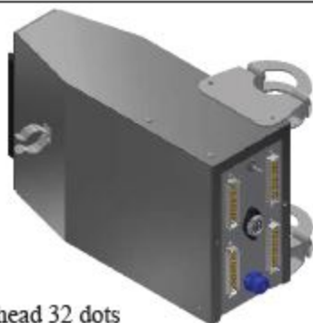
NZ head 32 dots