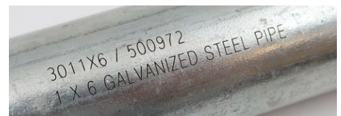
Galvanized pipe mark