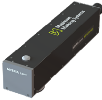
Fiber 100W DE/WD