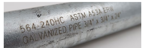
Galvanized steel pipe mark