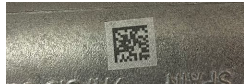
Metal part mark