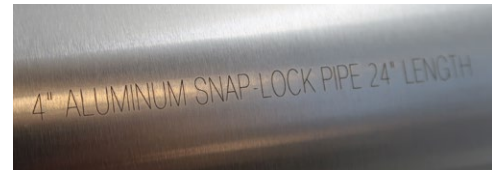
Aluminum pipe mark.