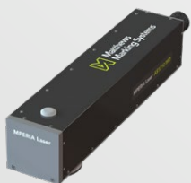
Fiber 20W DE/WD