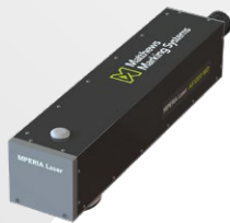
Fiber 50W DE/WD